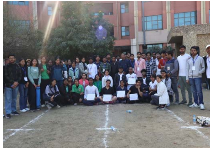
Winners of the Competition