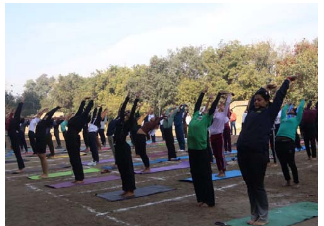
Students from various institutions doing numerous rounds of Suryanamaskar in the Competition at Deen Dayal Upadhyay College.